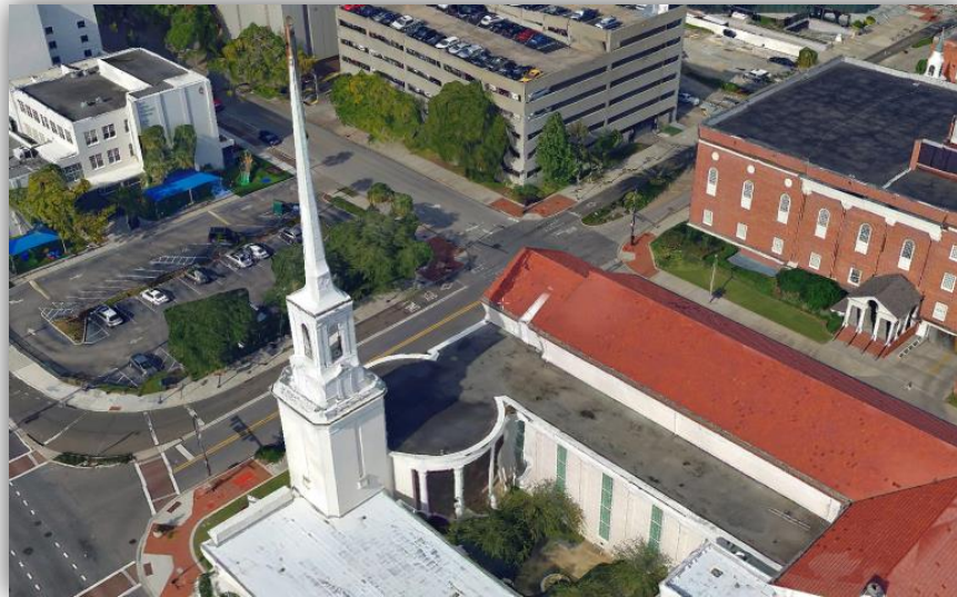
Orland, FL