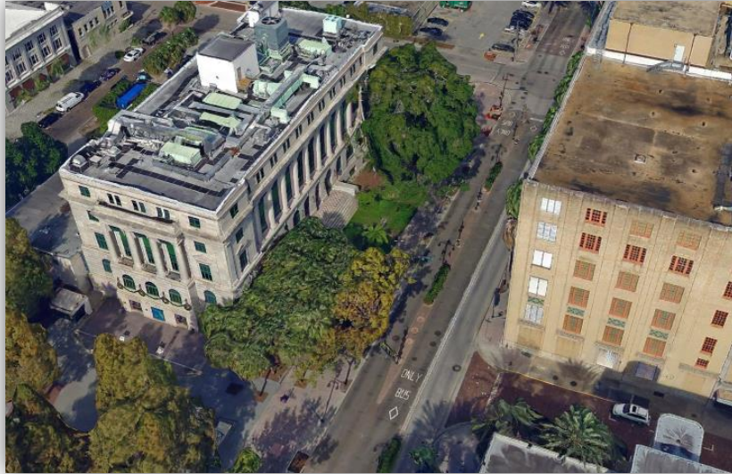
Orland, FL © Dat'Air